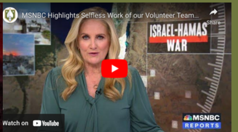
MSNBC DID A VETERAN'S DAY SPECIAL FEATURE OF OUR WORK EVACUATING AMERICAN CITIZENS FROM ISRAEL AND GAZA