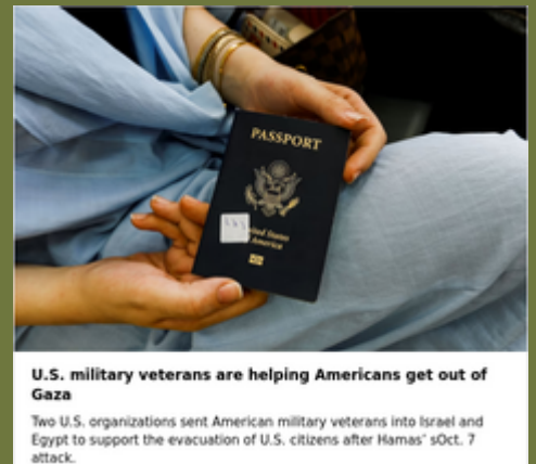
U.S. military veterans are helping Americans get out of Gaza

TAUGHT SURVIVAL TECHNIQUES TO THOSE STUCK IN GAZA (I.E. HOW TO MANEUVER TO SAFE LOCATIONS, HOW TO DISTILL BRACKISH WATER AND URINE, AND HOW TO EXTRACT WATER FROM LEAVES)